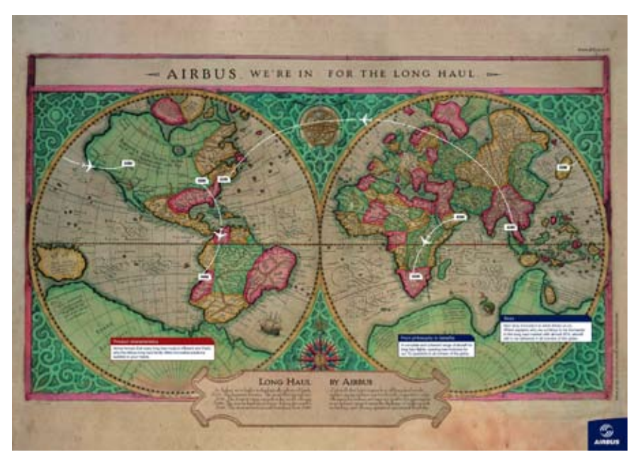
Airlines and aircraft makers tout their long-rang capabilities: good for travelers, but also good for spreading disease globally.

level of public health and a high level of poverty. Governments must contend with these two problems in their efforts to stop infectious disease.